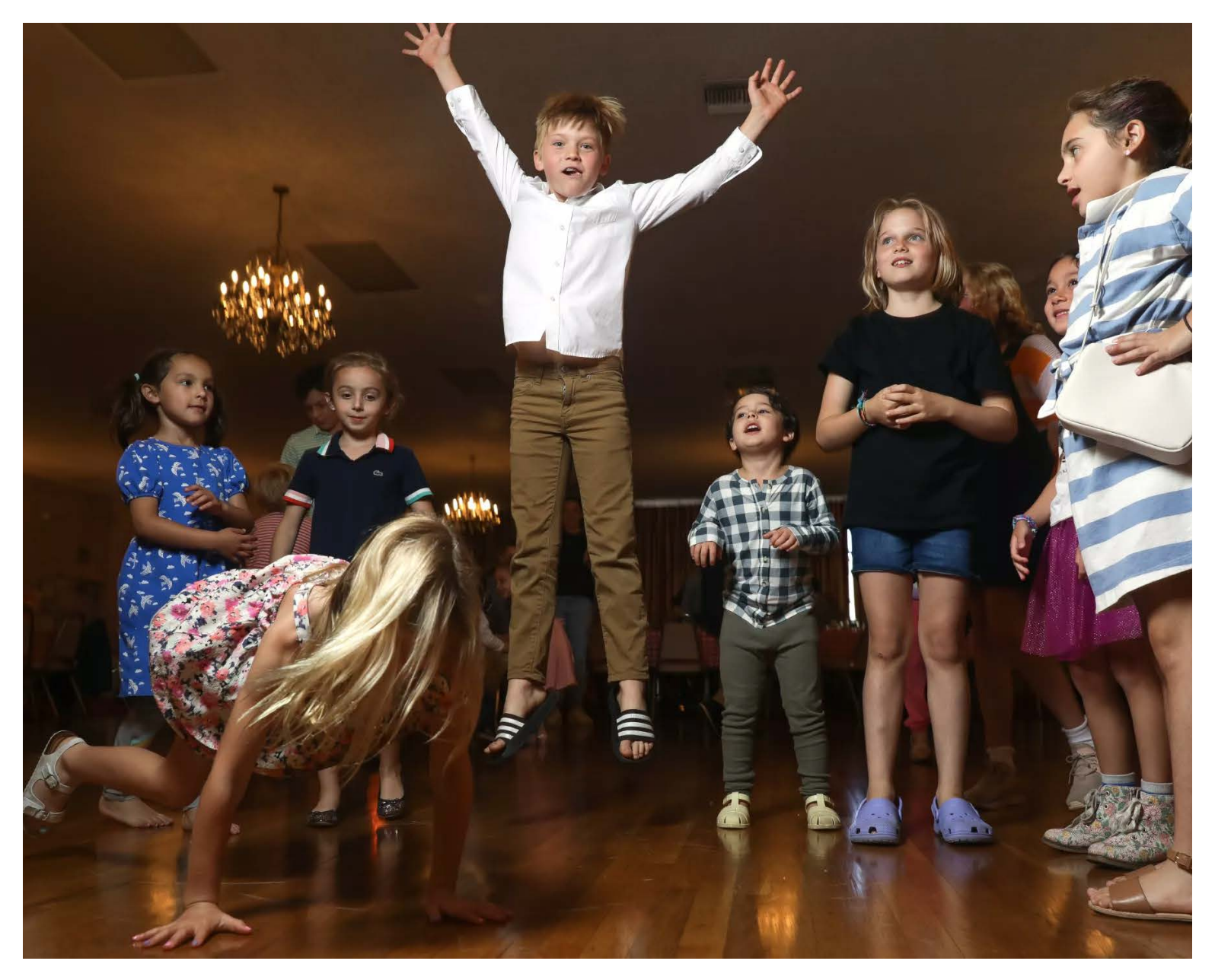
her on the dance floor at the Garibaldina Society in Los Angeles during a La Famiglia Dinner.

Older Italian men still cook big pots of tomato sauce in the industrial-sized kitchen and the majority of the weekday bocce players are well over 80, but in the last year, Gen Xers and millennials hungry for community and nostalgic for the social organizations of their parents' and grandparents' eras are bringing a new energy to the club.