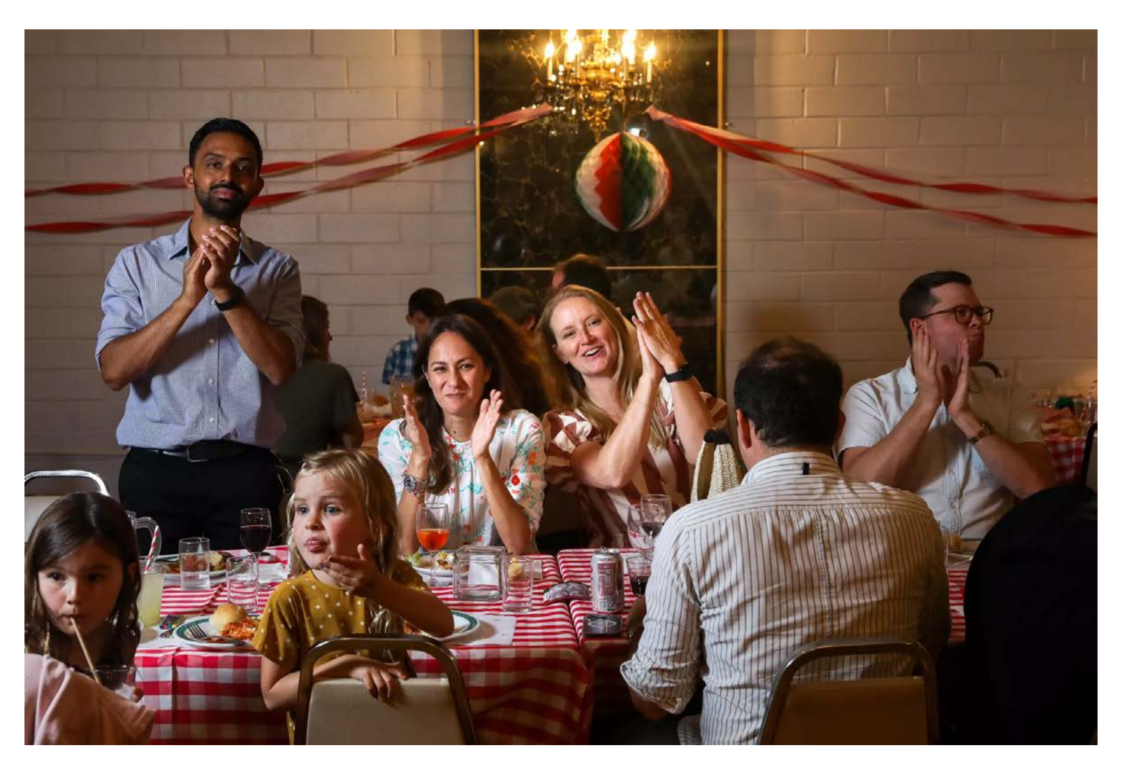
Families clap during a game of musical chairs on the dance floor at the Garibaldina Society's La Famiglia Dinner.