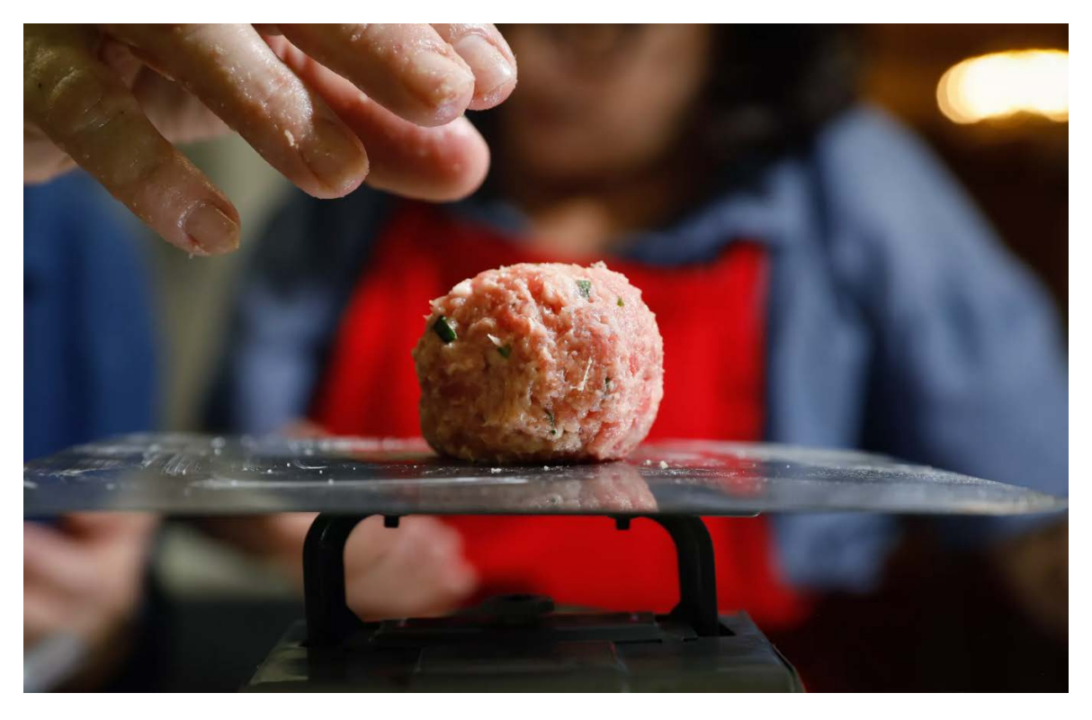
Garibaldina Society members weigh meatballs on a small scale so that they are all just the right size.